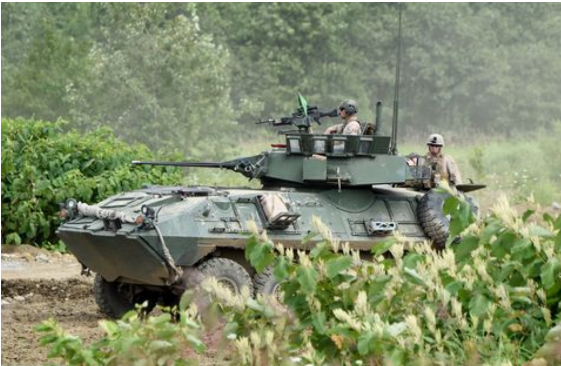
U.S. Marine Corps LAV-25.

All of this adds up to a very capable vehicle that can take on most ground-based threats, from enemy infantry to tanks, at ranges of up to 4,000 meters. In the world of reconnaissance there are two types of recon or cavalry forces: lightly armed "sneak and peek" forces that hide and passively observe the enemy, and recon forces that expect to fight for information, duking it out with the enemy's own recon forces. Jaguar falls solidly into the latter category.