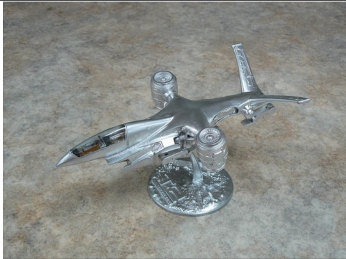
Third Place Entry 20 by Dale Summers Aerial Hunter Killer (Piloted) Pegasus 1/32 Scale