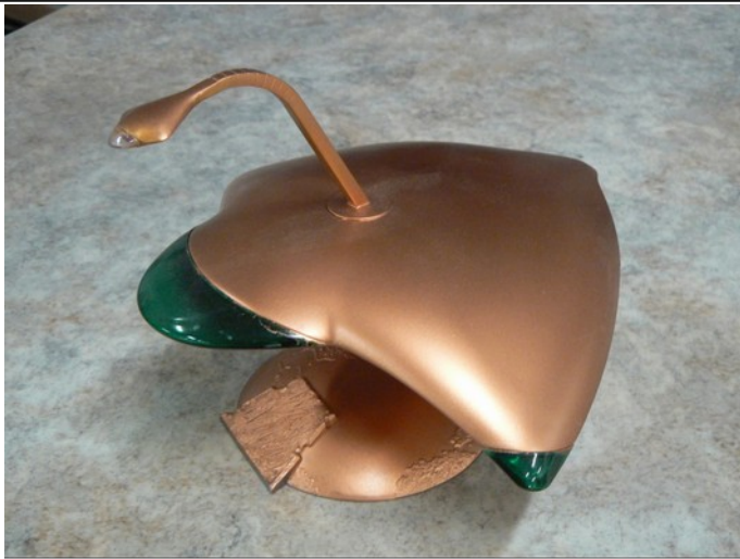
Category 12 -Miscellaneous