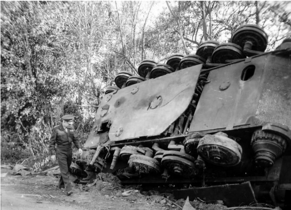
Gen. Dwight D. Eisenhower, supreme commander of the Allied expeditionary forces, inspects an overturned German tank left by a roadside in France.

They also discovered that the quality of German was considerably worse when compared to earlier versions of the Tiger I and Panther tanks. This is likely attributable to a lack of resources during manufacturing late in the war, but it's worth noting that malfunctions were also a merit of slave labor, brave prisoners who intentionally sabotaged their work. When I was at Ford, I was talking to my foreman in the late 90's and he was telling me a story, he was an older gentleman and worked his way from hourly to supervisor. Actually was a nice guy. But I digress, he noticed a book I was reading at the time called "DeathTraps", it was about the American Sherman and he told me that his dad was a driver on a Sherman and that a German Soldier got the drop on them with a Panzerfaust and his dad told him "We were toast, the guy had us cold, but when he pushed the trigger, it blew up on him". That kinda gave me chills, I remembered reading stories about the convict labor sabotaging German armaments as they left the factory and many of them got caught and executed by the Gestapo.