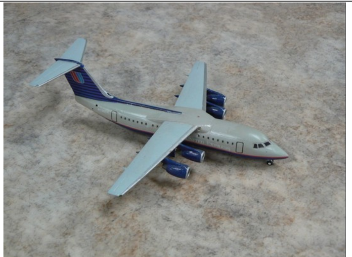
Third Place Entry 25 by Dale Summers BAe-146 United Express Revell 1/144 Scale