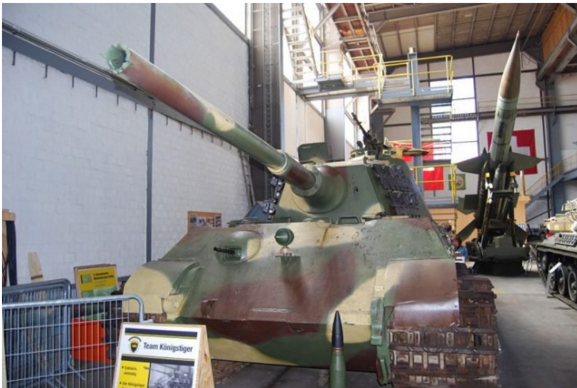
Panzerkampfwagen VI Tiger II (341) in the Swiss Militärmuseum Full, Notice the barrel