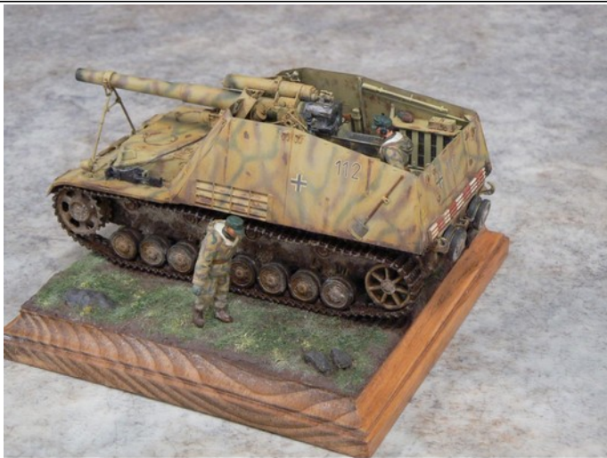
Category 8 – Armor – 1/35 and Larger – Bad Guys

First Place Entry 22 by Dale Summers Leopard II Winter Camouflage Tamiya 1/35 Scale