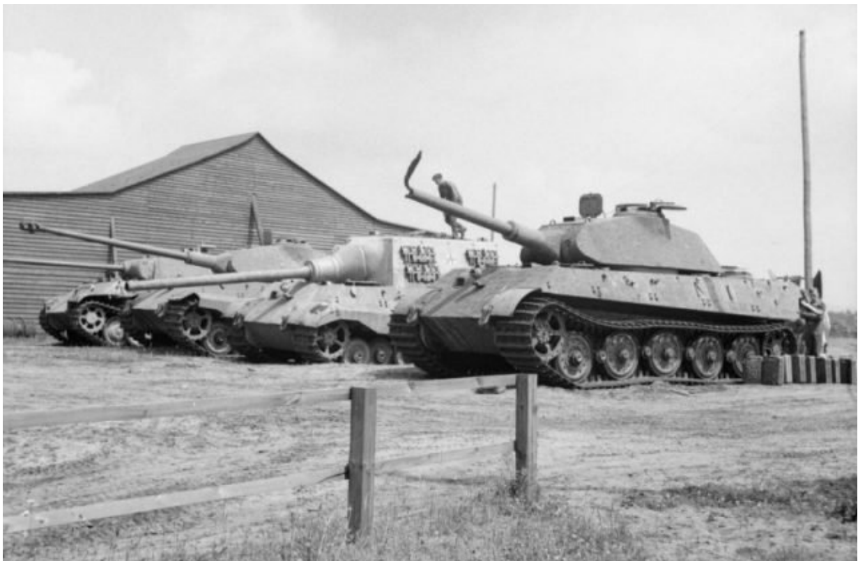
Four German heavy tanks at the Panzer experimental establishment in Haustenbeck near Paderborn