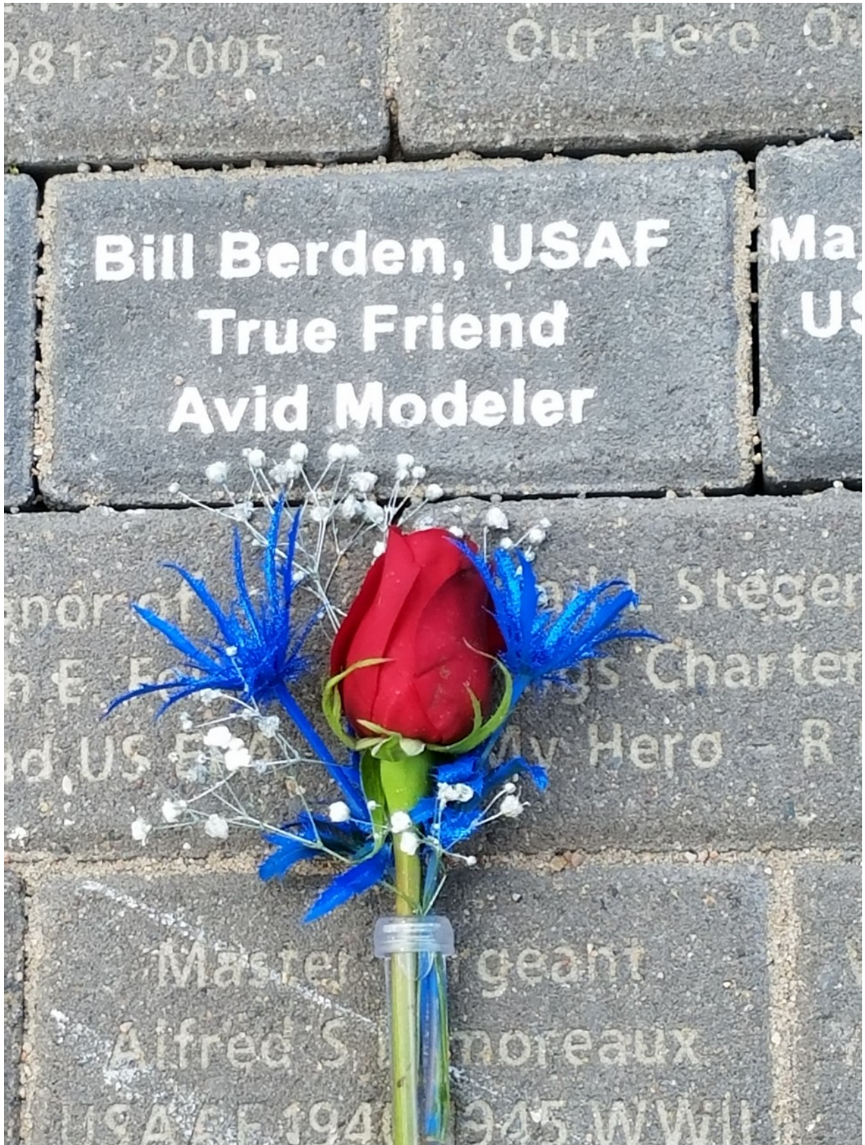
At Wings Over The Rockies