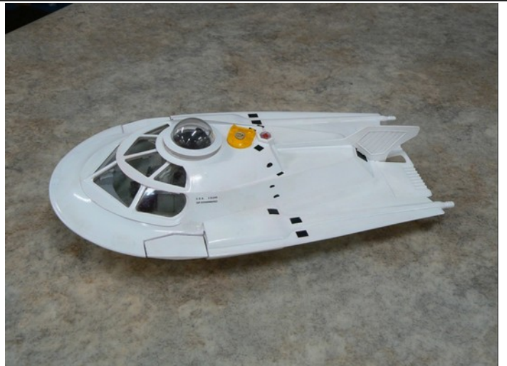
Entry 19 by Dale Summers Proteus Experimental Submarine Moebius 1/32 Scale