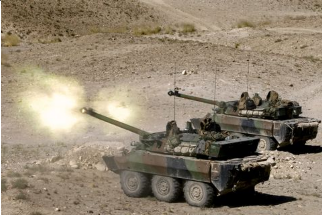
AMX-10RCs with the 1st Regiment Marines Infantry, Afghanistan, 2010.

All three of the vehicles the Jaguar replaces are more than thirty years old with obsolete armament. The 105-millimeter gun of the AMX-10RC can no longer penetrate the frontal armor of modern tanks, and the HOT anti-tank missile, comparable to the American TOW-II, is also an older system with questionable utility against new tanks.