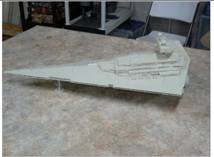
Entry 23 by Dale Summers Star Destroyer Revell 1/2700 Scale