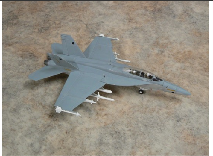
Entry 33 by David Bathke F/A-18F Super Hornet Italeri 1/72 Scale