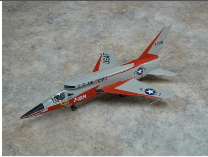
Second Place Entry 34 by David Bathke XF-107 Unknown Asian Company 1/72 Scale