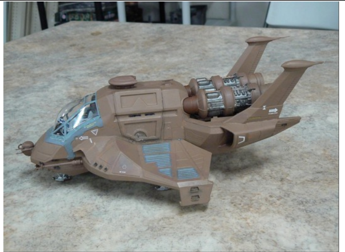
Second Place Entry 16 by Dale Summers Colonial Raptor Moebius 1/32 Scale