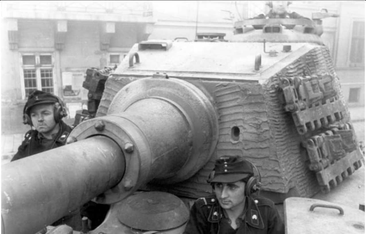
Close view of Zimmerit on the turret of a Tiger II.