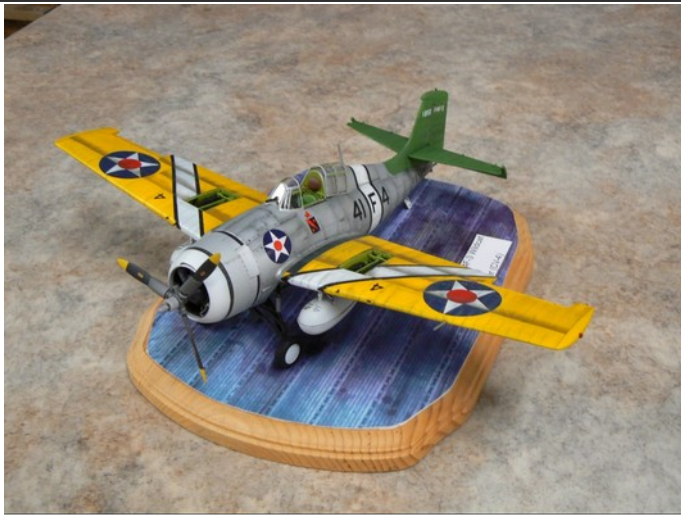
Category 6 -Aircraft 1/32 and Larger

First Place Entry 7 by Matt Oursler F-4F-3 Wildcat Trumpeter 1/32 Scale