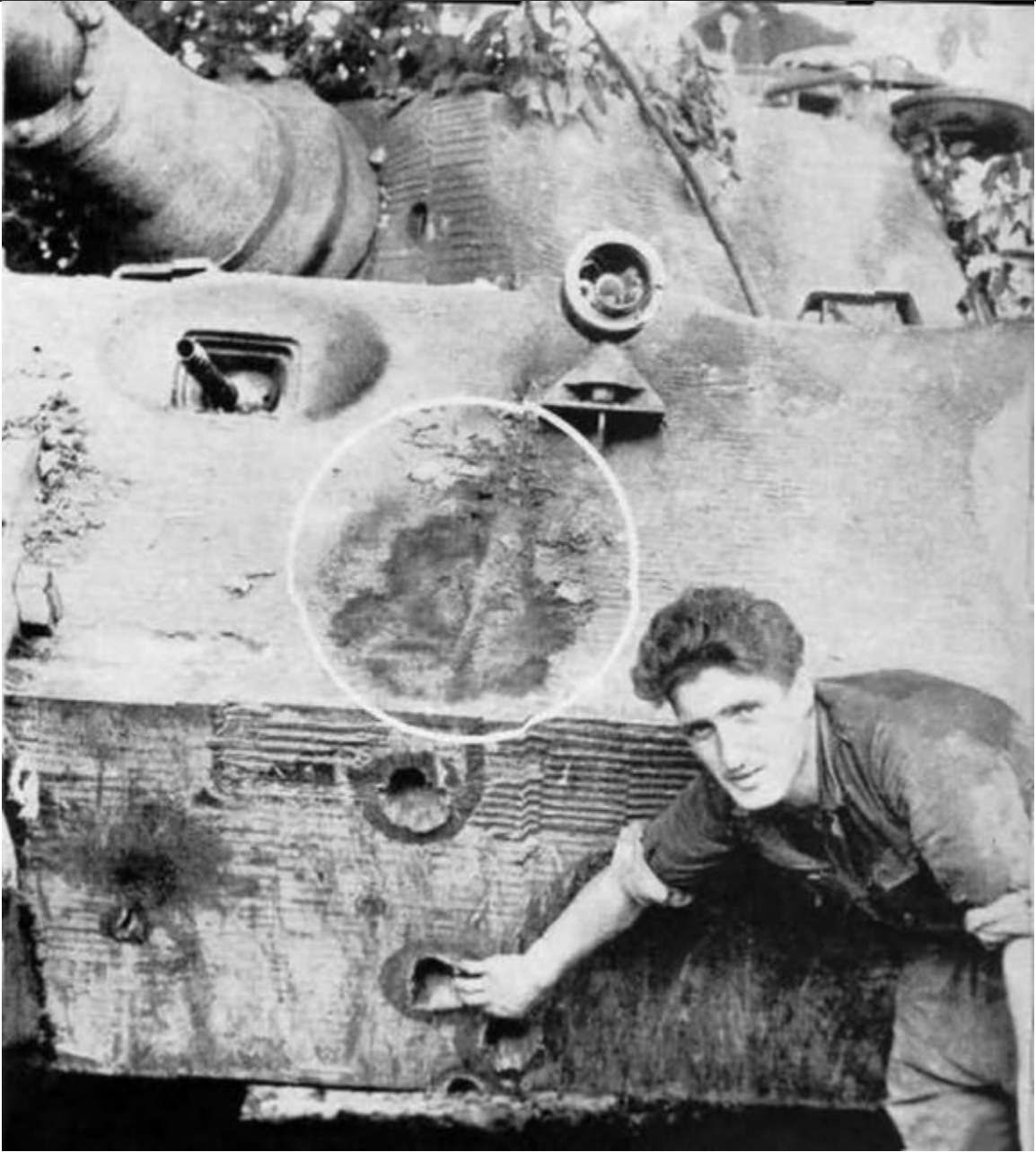
Front view. Note the damage on the bottom.