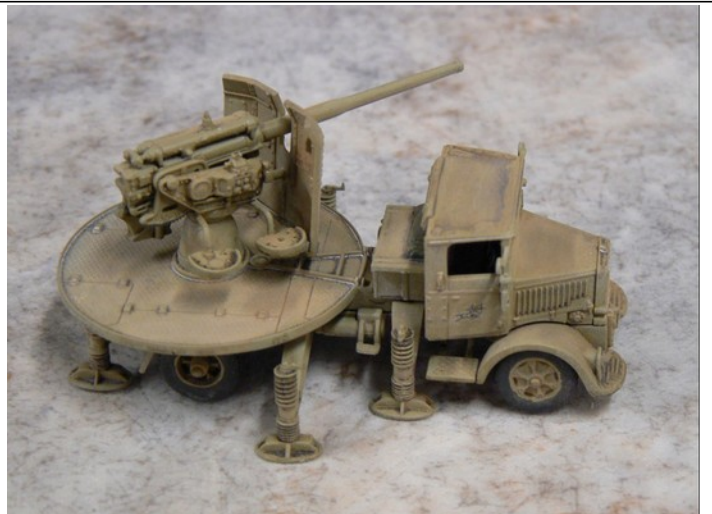
Category 9 – Armor Smaller than 1/35

First Place Entry 12 by Mike McTigue Hummel 165 Dragon 1/35 Scale