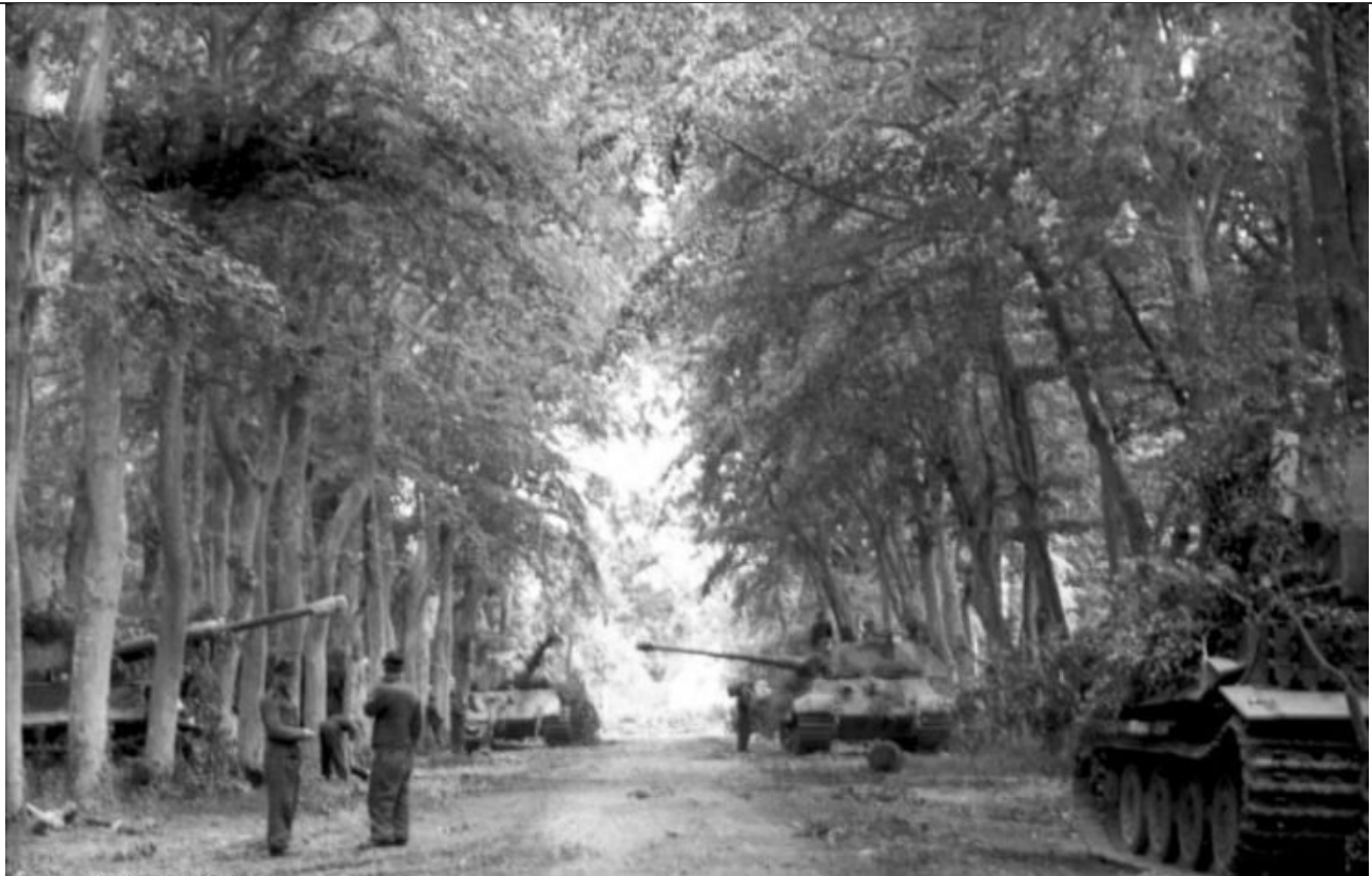
Juli 1944