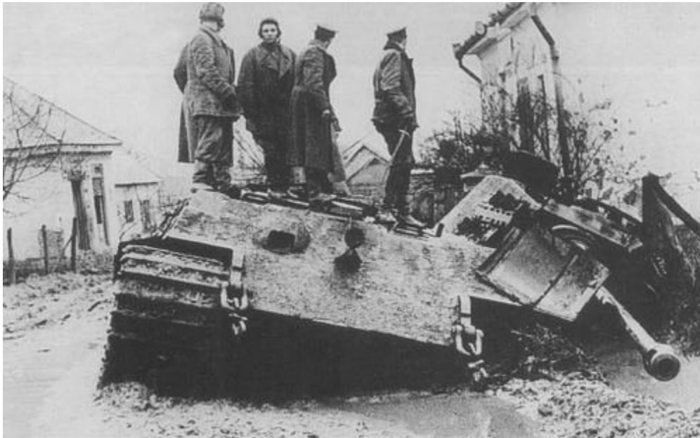
Tiger II knocked out by two AP rounds – Eastern Front 1944