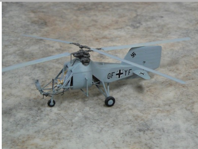
Category 3 -Aircraft 1/71 through 1/31Props – Single Engine