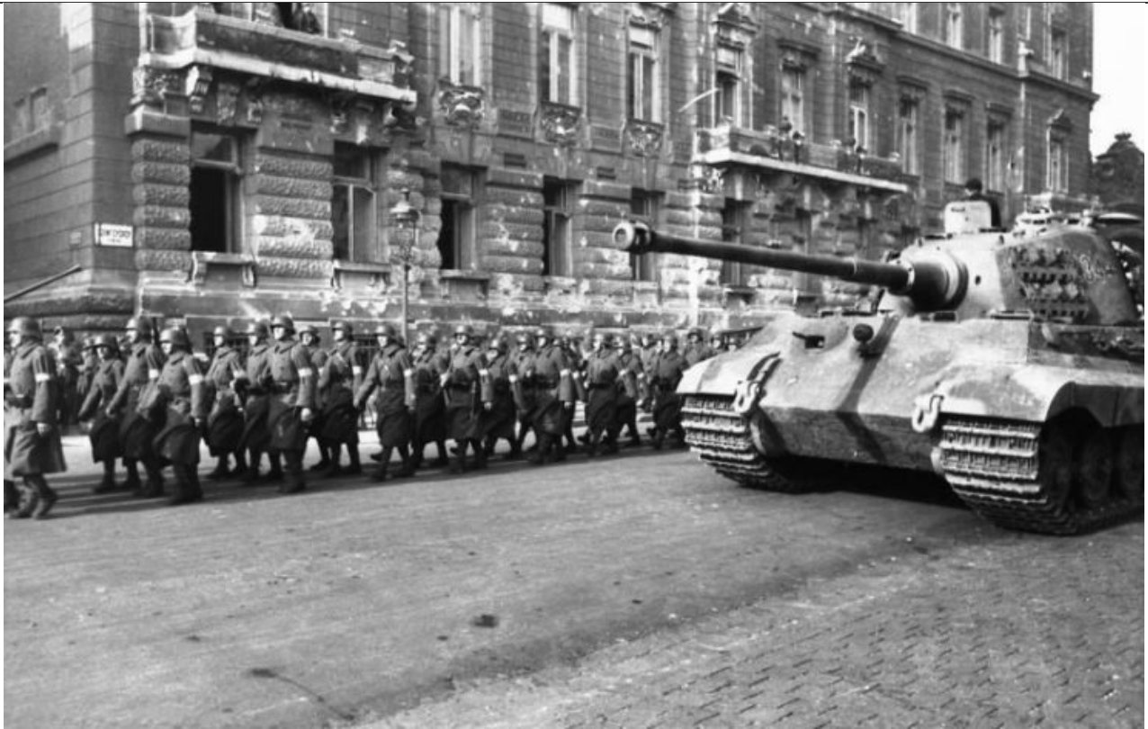
A Tiger II of s.H.Pz.Abt. 503 and Hungarian troops in a battle-scarred street in Buda's Castle district, October 1944.