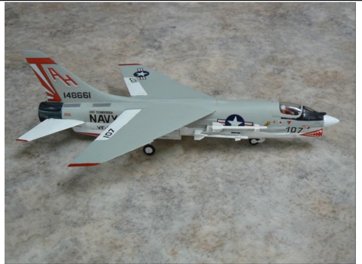
First Place Entry 30 by Davie Bathke F8U-3 Crusader II AMT 1/72 Scale