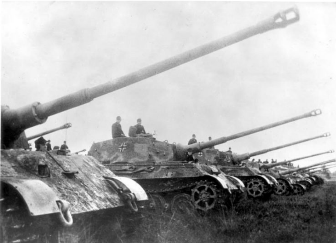
Tiger IIs with the narrower “transport tracks”, of Schwere Heeres Panzer Abteilung 503 (s.H.Pz.Abt. 503) ‘Feldherrnhalle’ posing in formation for the German newsreel.

engagements, Berlin fell and the war was over.