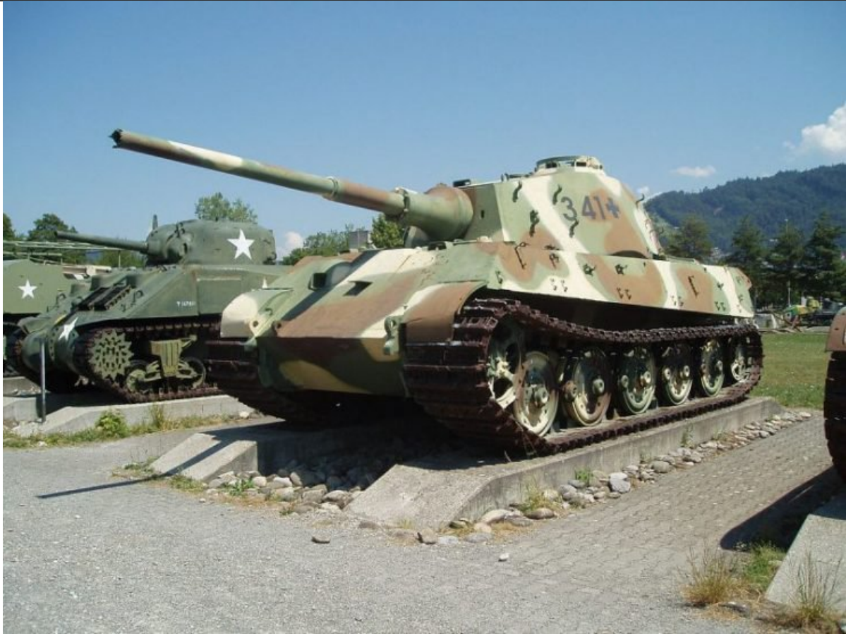
Panzerkampfwagen VI Tiger II at the Panzermuseum Thun.