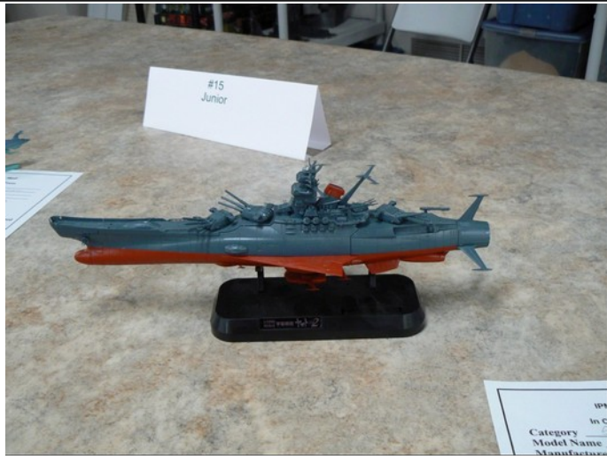
Category 15 – Juniors