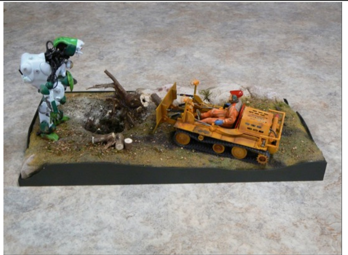
Category 14 – Dioramas, Fiction/Fantasy