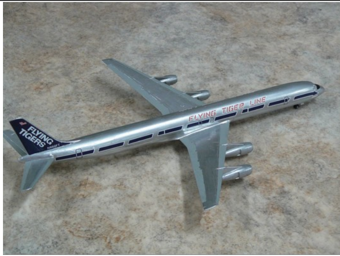
Entry 31 by David Bathke DC-8 Lodella/Revell 1/144 Scale