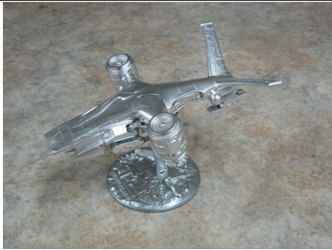
Entry 21 by Dale Summers Aerial Hunter Killer Pegasus 1/32 Scale