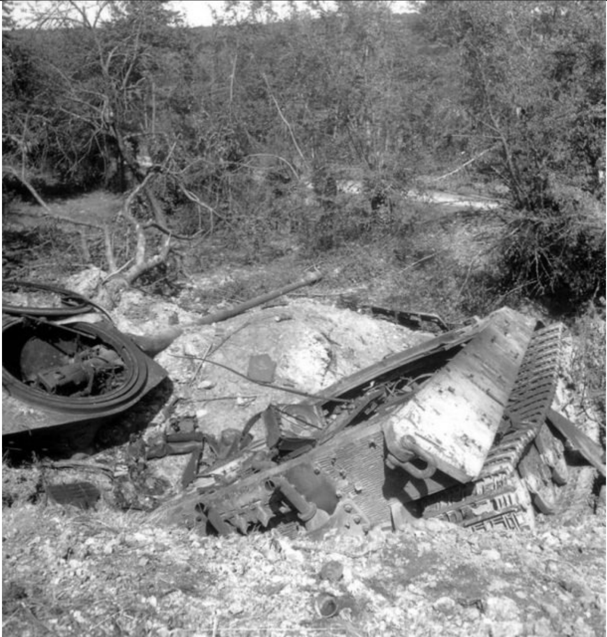
Destroyed in Normandy, 1944 Ed Note might be an interesting diorama