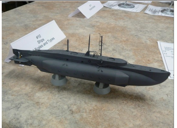
Category 10 – Ships – All Scales and Types