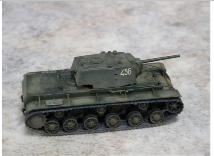
Second Place Entry 4 by Matt Levesque KV-1 M1942 Simplified Turret Tank Trumpeter