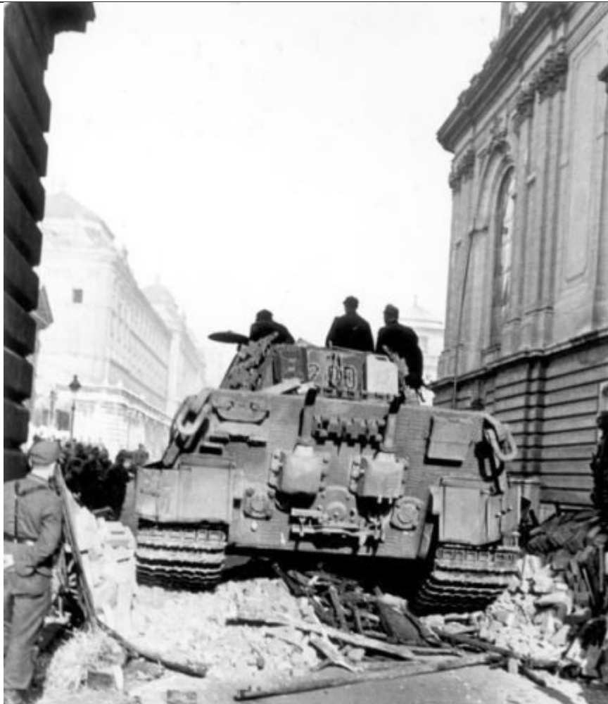
Rear view.

December 1944, the situation was much different. Monstrous and ponderous Tigers B were clumsy and slow. They blocked local bridges and were often more than a burden than a help.