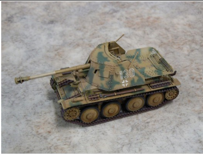
First Place Entry 13 by Danny Gallegos Marder III H Tamiya & Scratch 1/48 Scale