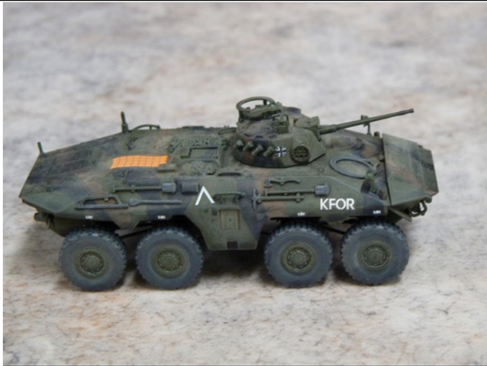
Third Place Entry 5 by Matt Levesque SpPz2 Luchs Revell Germany 1/72