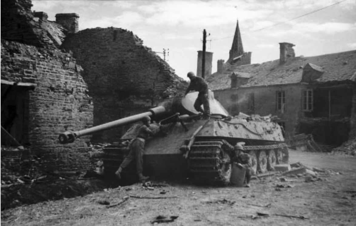
British troops inspect a knocked out King Tiger tank in Le Plessis-Grimoult, 10 August 1944

Orders were placed for around 1500, yet Allied bombings and the sheer cost reduced production to a third of that target – one was built in 1943, 379 in 1944, and 112 in 1945. The cost for one Tiger II was double that of a Tiger I and 5 times that of a Panther. In contrast, the Soviets could produce 10 T-34's for about the same amount. Production of T-34's armed with an 85mm gun alone reached 22,559. One on one the Tiger was superior, but they got swarmed by the T-34's or Shermans.