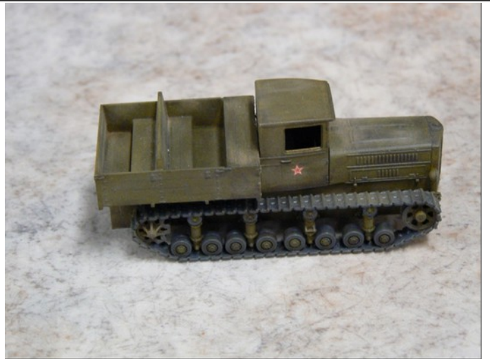
Entry 3 by Matt Levesque Soviet Konminern Artillery Tractor Trumpeter 1/72 Scale