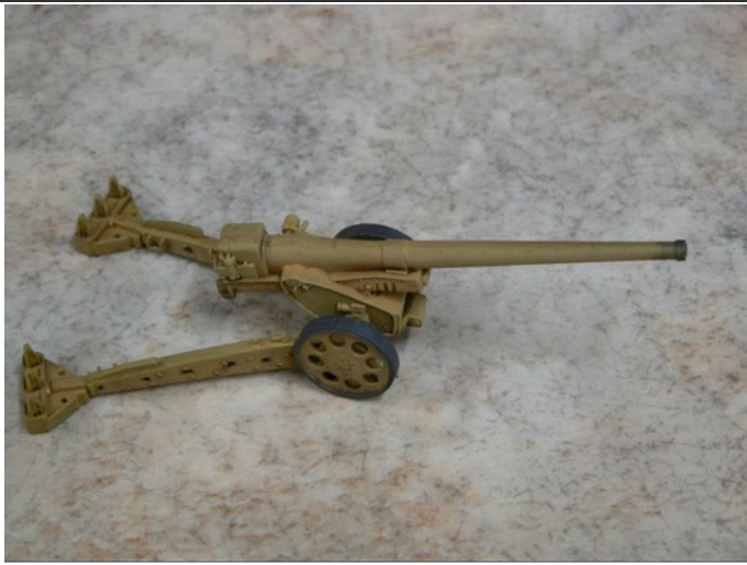
Entry 2 by Matt Levesque Italian Heavy Gun 149/40 Waterloo 1815 1/72 Scale