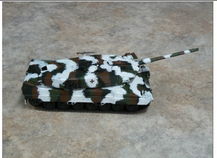
Category 7 – Armor – 1/35 and Larger – Good Guys

First Place Entry 7 by Matt Oursler F-4F-3 Wildcat Trumpeter 1/32 Scale