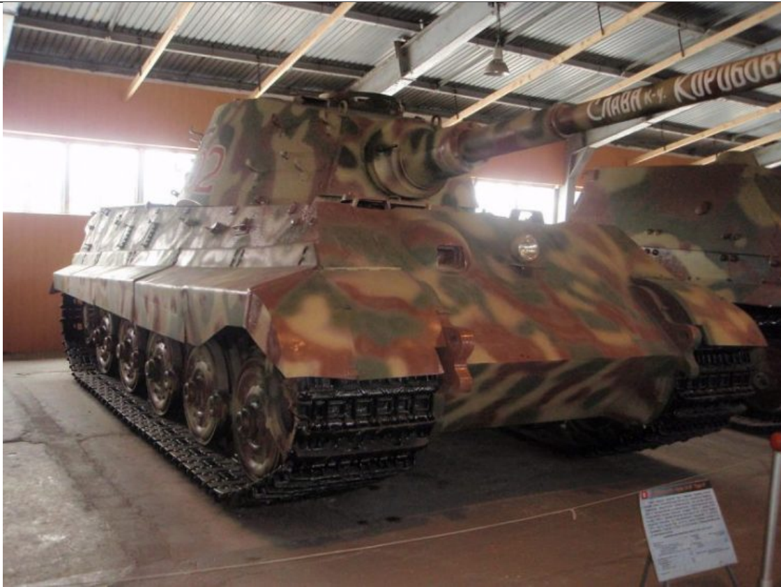
Panzerkampfwagen VI Tiger II (502) in the Kubinka Museum