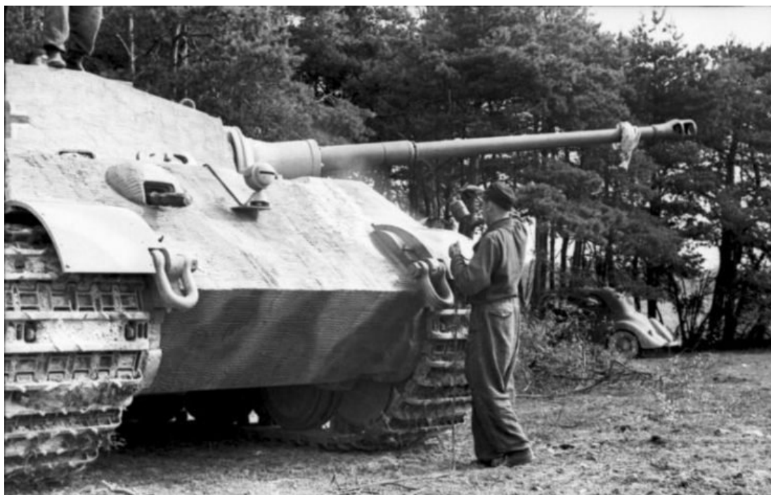
Juni 1944