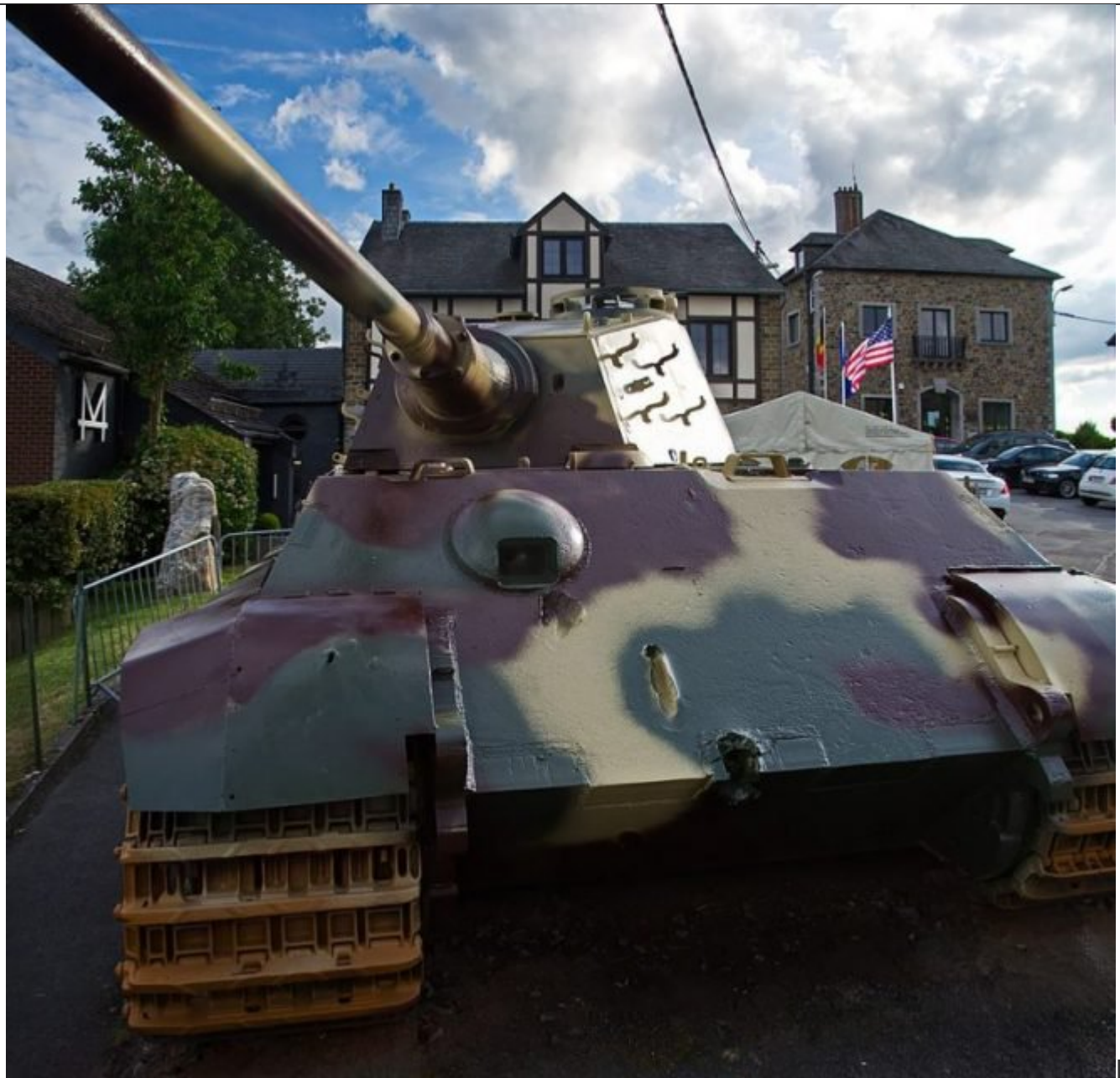
Panz erkampfwagen VI Tiger II (213) in the December 44 Museum.