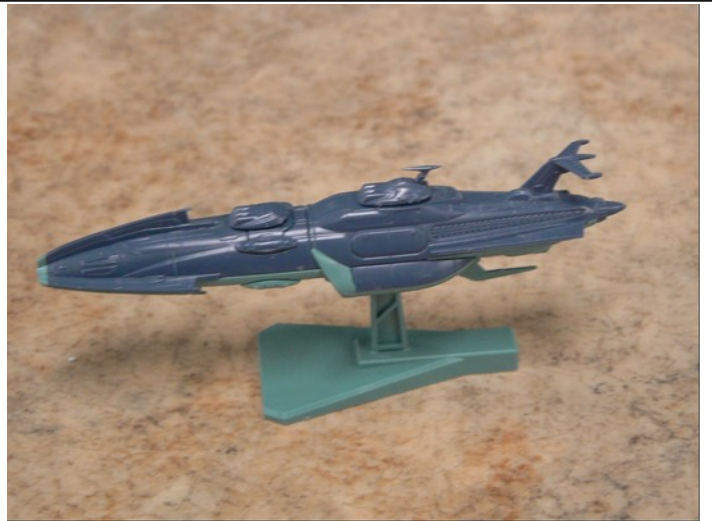
Second Place Entry 27 by Zeke Jones Earth's Defense Ship 2202 Bandai 1/1000 Scale