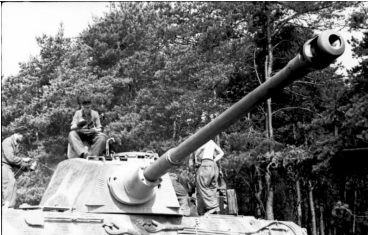
Juni 1944