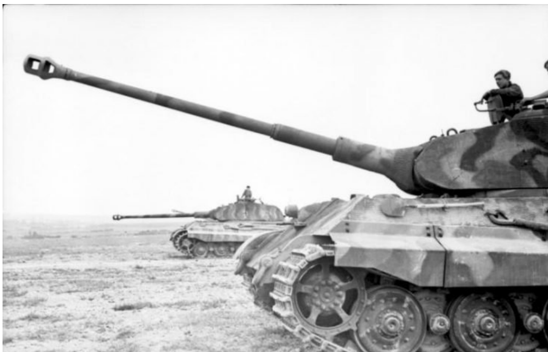
Königstigers in Northern France, 1944.