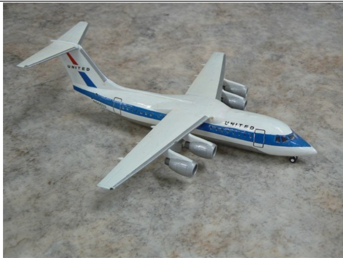
Entry 26 by Dale Summers BAe-146 Retro Colors Revell 1/144 Scale