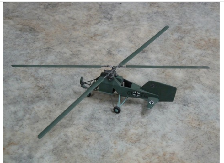
Second Place Entry 14 By Dale Summers Flettner FI-282 German Airforce Huma 1/48 Scale